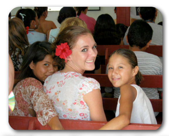
WHAT internship opportunities are available?

*Longer term internships are available. If you're interested, we'll be glad to discuss the possibilities.